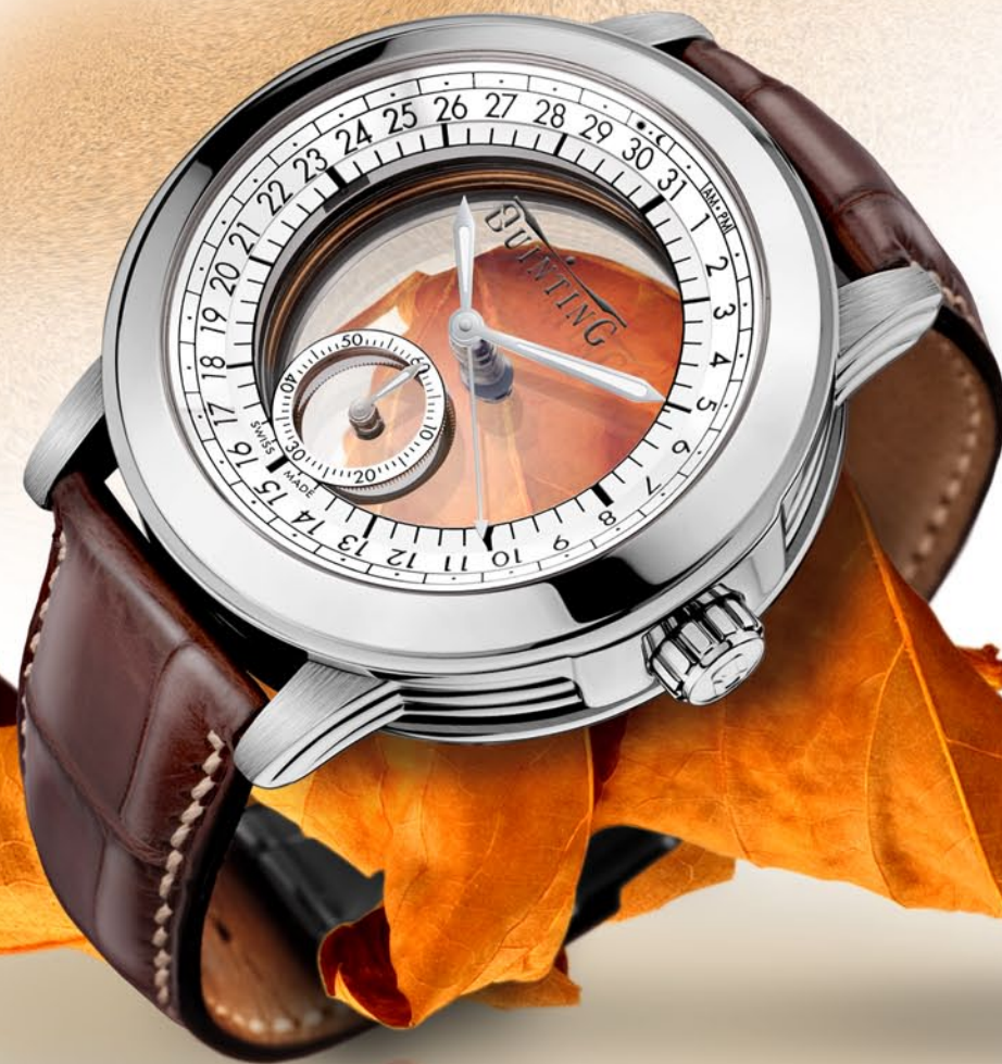
Q4SL51 (page 33) Stainless Steel • Date with AM/PM indication