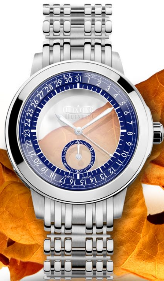
Q4SS2 (page 32) Stainless Steel • Date with AM/PM indication