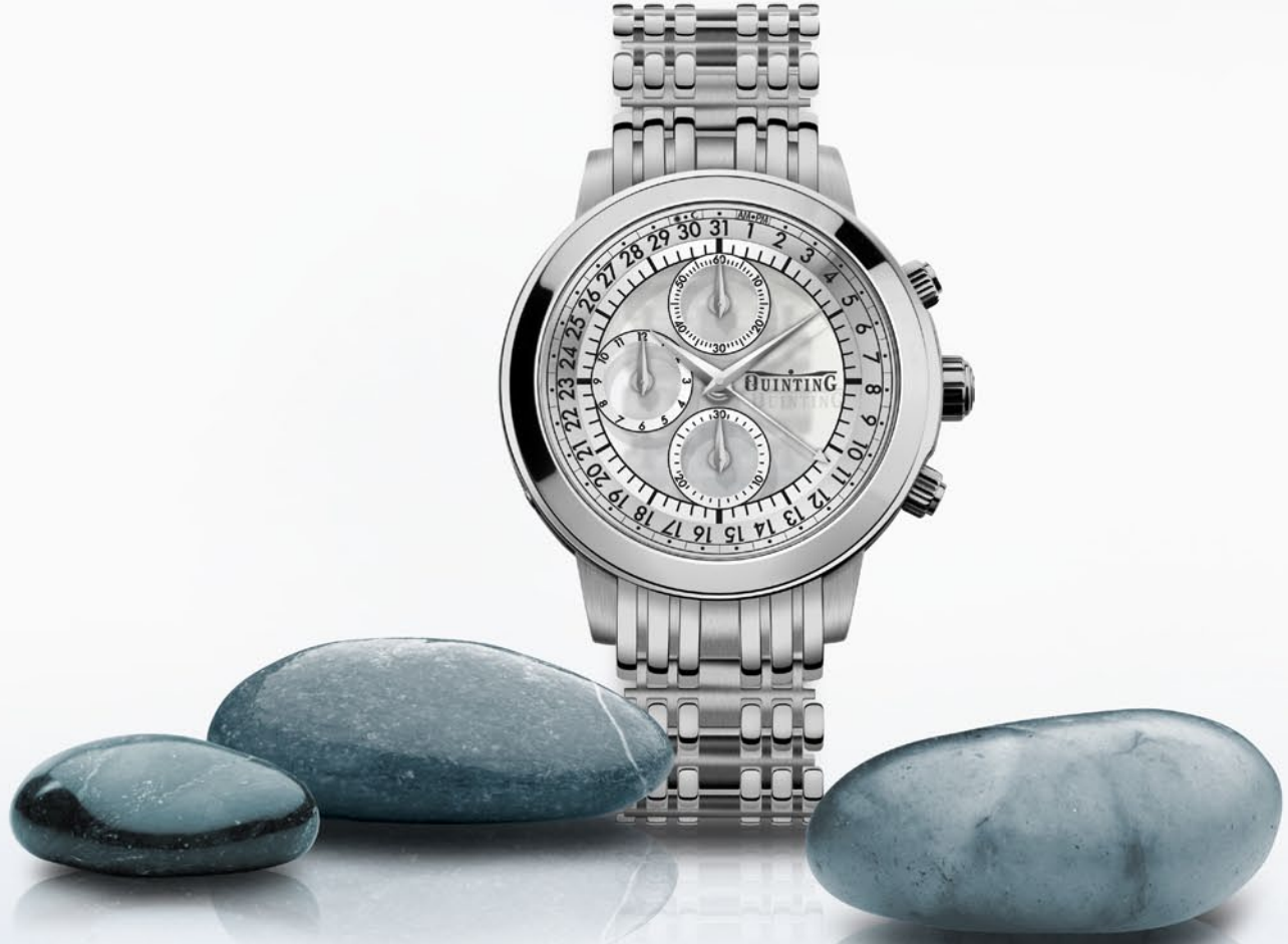
QSS6 (page 16) Stainless Steel • Date with AM/PM indication QBSL55 (page 17) Black PVD Coated Stainless Steel • Date with AM/PM indication