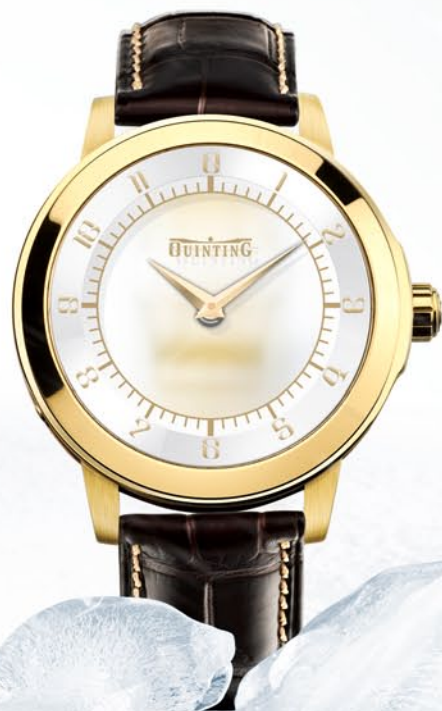
Q5GL51 (page 40) Yellow Gold 18 Kt