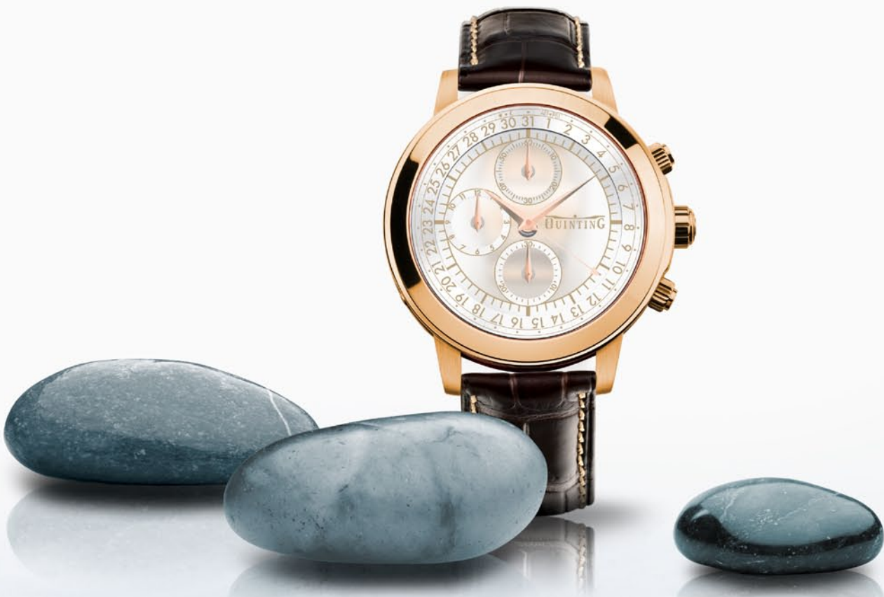
QSL55 (page 12) Stainless Steel • Date with AM/PM indication