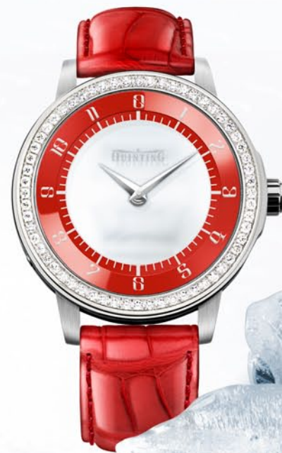
Q5PGL55D (page 36) Pink Gold 18 Kt • Diamonds 1.38 ct TW/VVS