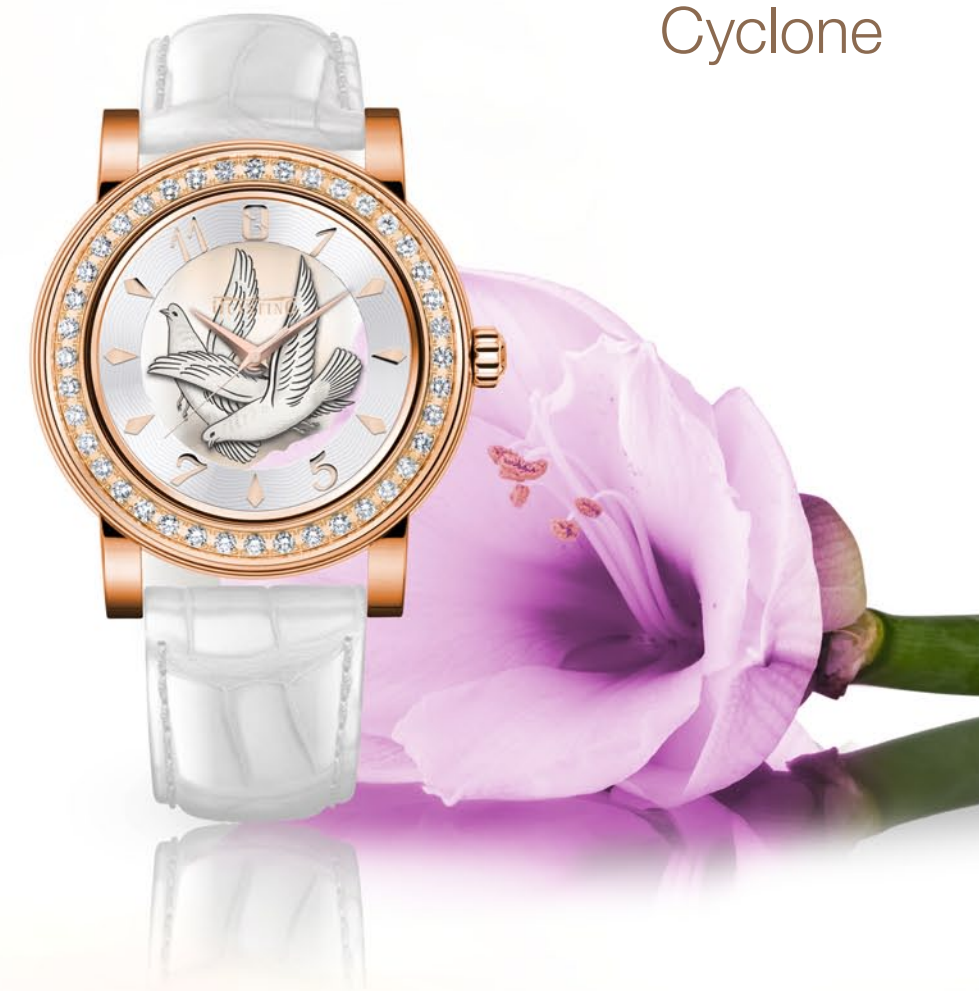
Q2STDA15A (page 20) Stainless Steel • Diamonds 0.24 ct TW/VVS