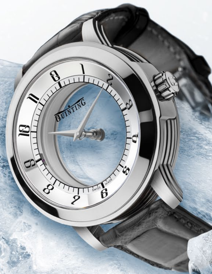
Q5SL56 (page 41) Stainless Steel