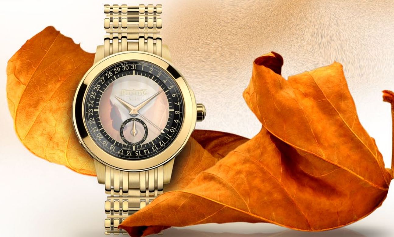
Q4PGL60 (page 28) Pink Gold 18 Kt • Date with AM/PM indication