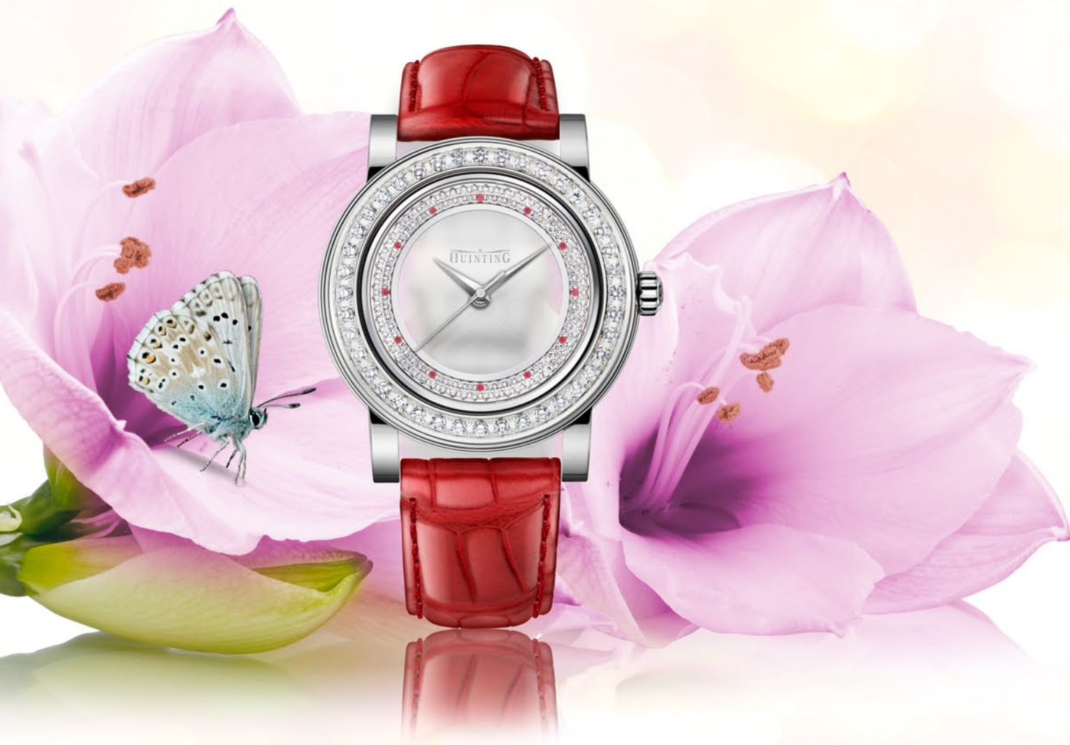
Q2STDC51 (page 24) Stainless Steel • Diamonds 1.734 ct TW/VVS Rubies 0.0618 ct